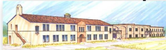
Renovate Buildings 300 & 500 [Construction Documents]