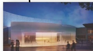
New Veterans' Resource Center & Student Activities Center Expansion [Construction]