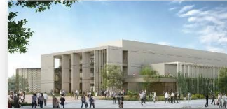
New Science, Engineering and Mathematics Building [Construction]