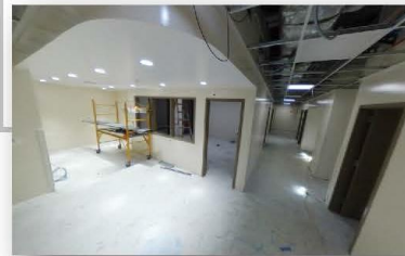
10th Floor Buildout [Construction]