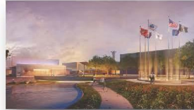
Veterans' Memorial Bridge & Tribute Garden [Construction]