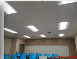
7th Floor Buildout [Complete]