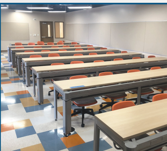
New 10 th Floor Professional Development Learning Center at Anaheim Campus

At Fullerton College, the New Instructional Building and Central Plant Replacement and Expansion plans have received approval from the Division of the State Architect (DSA). Construction start is anticipated in the first quarter of 2020. Similarly, the Renovation of Buildings 300 and 500 has also received DSA approval.