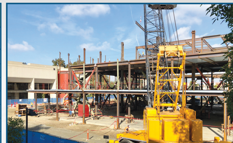
Construction Progress at New SEM at Cypress College