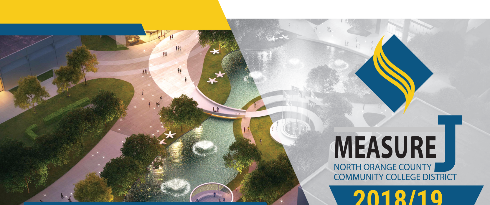
Design Rendering for the Veterans' Memorial Bridge and Tribute Garden at Cypress College