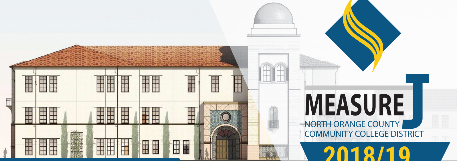
Design Rendering of the New Instructional Building at Fullerton College