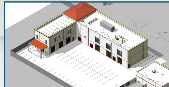
Design Rendering of the New Maintenance and Operations Building at Fullerton College