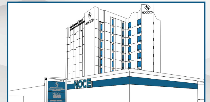
Sketch of the Exterior Signage at the Anaheim-NOCE Campus