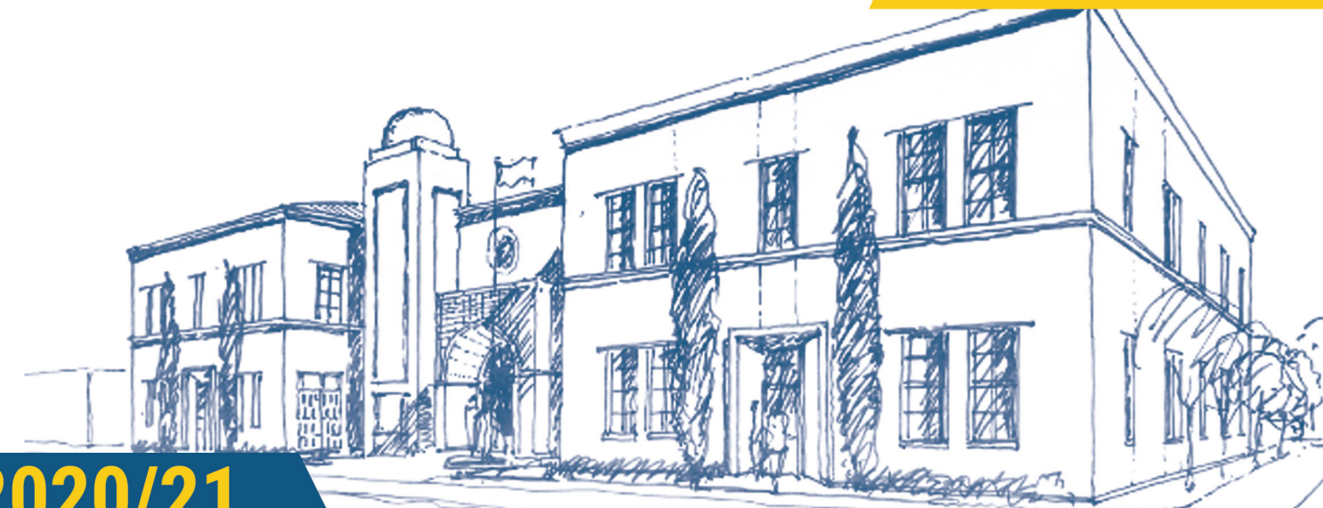
Design Rendering of the New Chapman/Newell Instructional Building at Fullerton College.