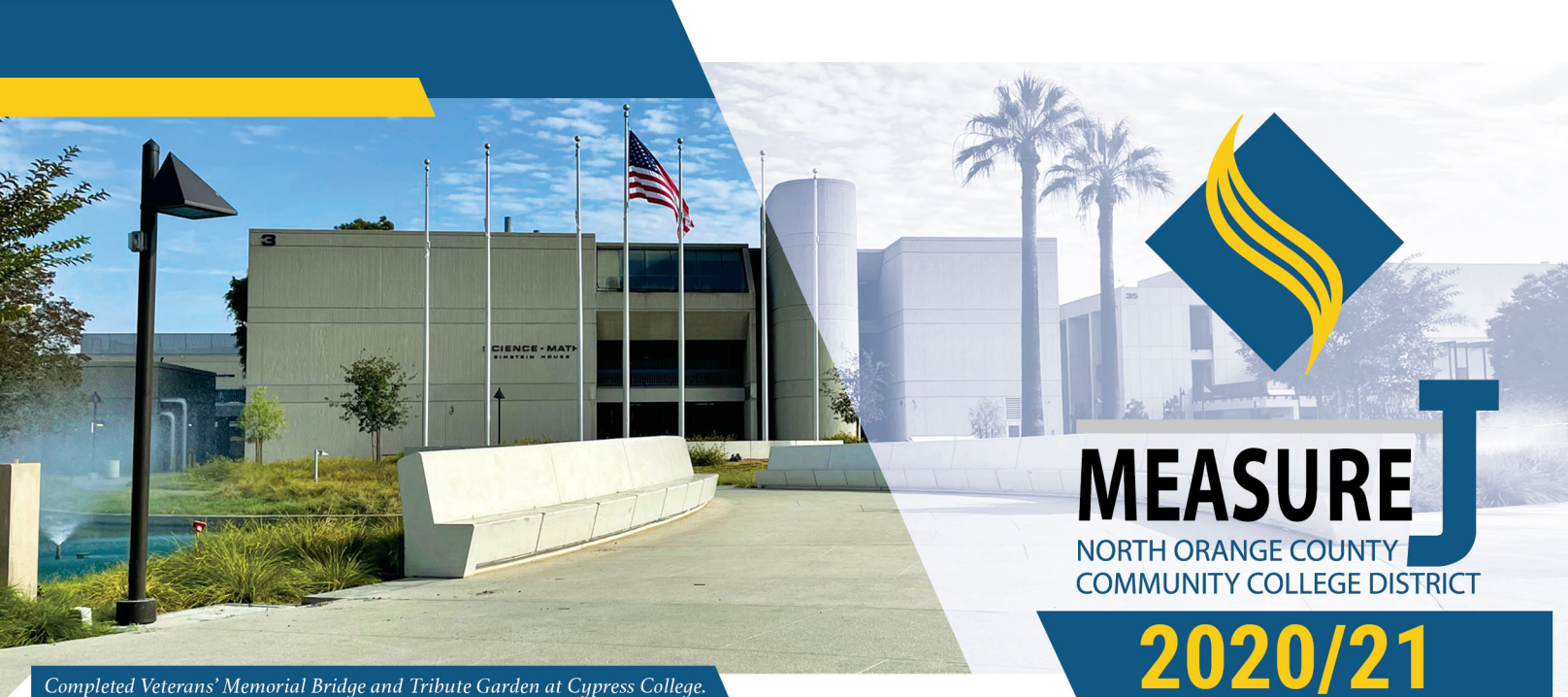
Completed Veterans' Memorial Bridge and Tribute Garden at Cypress College.