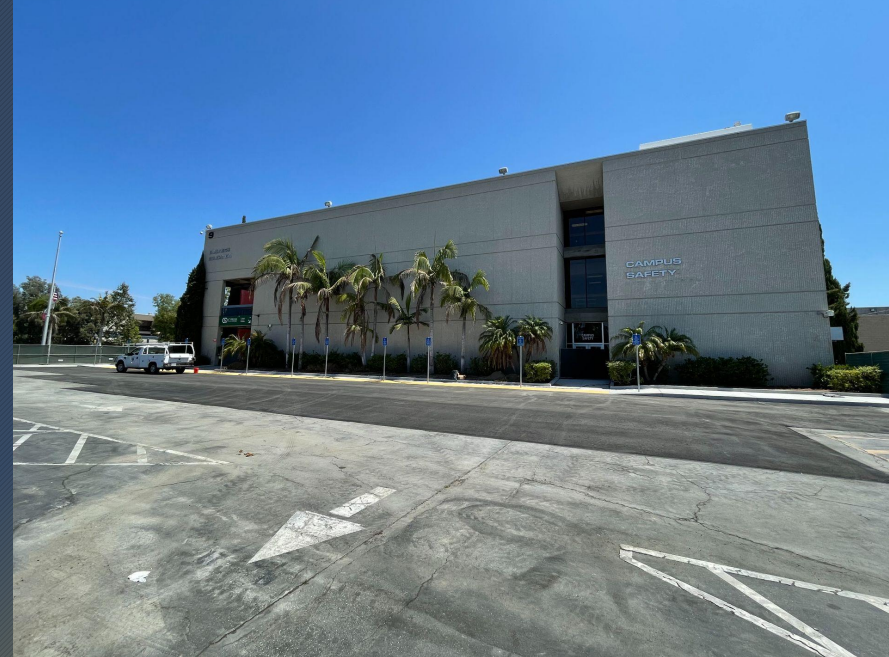
Americans with Disabilities Act (ADA) Barrier Removal – Parking Lot 1