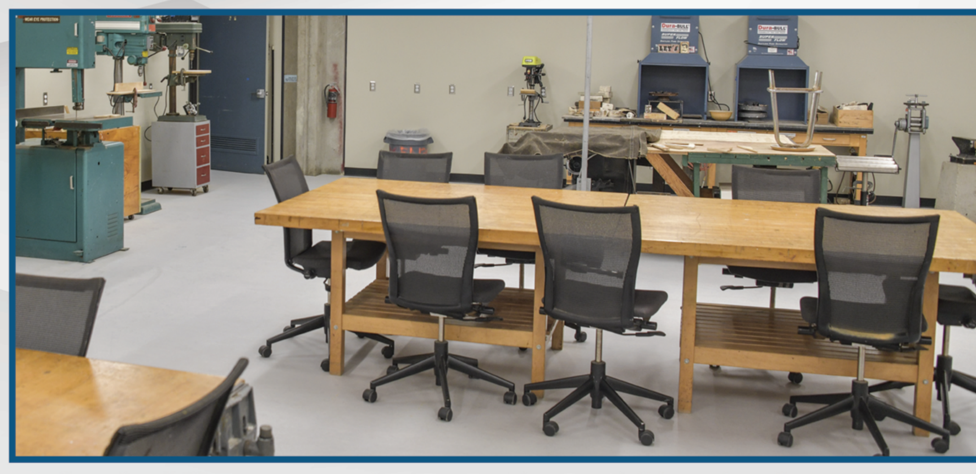
Completed Classroom at Swing Space – Fine Arts (Old SEM) at Cypress College