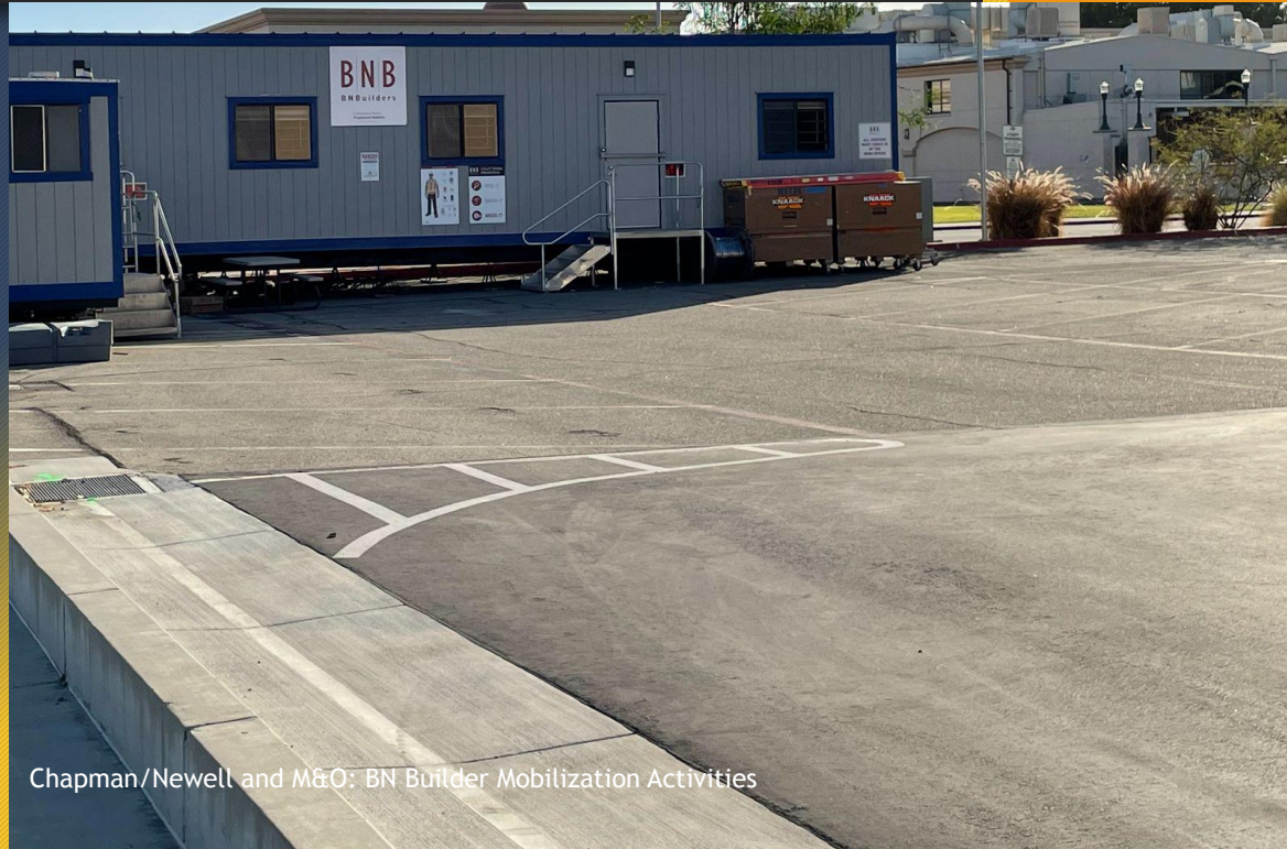
Chapman/Newell and M&O: BN Builder Mobilization Activities